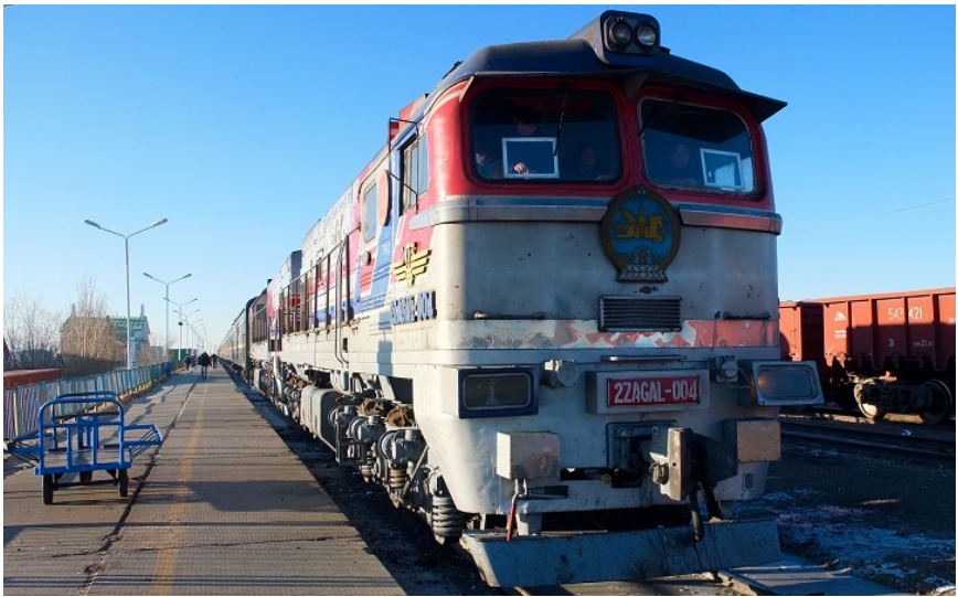
...and, the one at the back of the train.