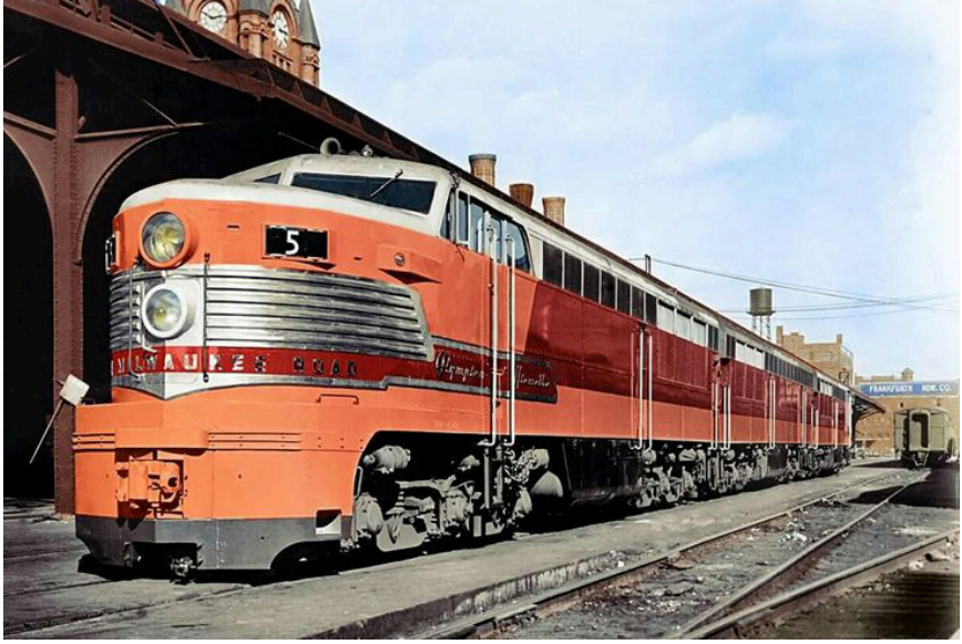
Locomotive like the one at the front of the Ghost Train...

For readers curious about the two locomotives mentioned in this book, here are a couple photographs for you.